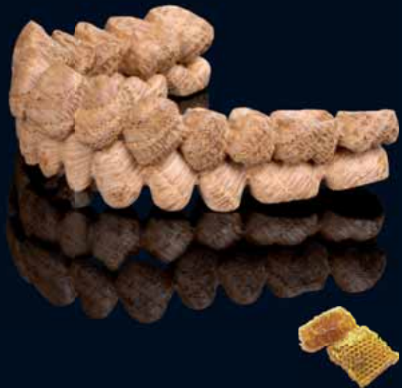
Oak, refined with beeswax