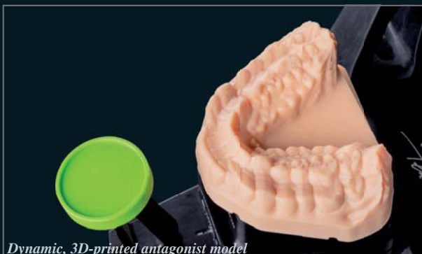
Dynamic, 3D-printed antagonist model