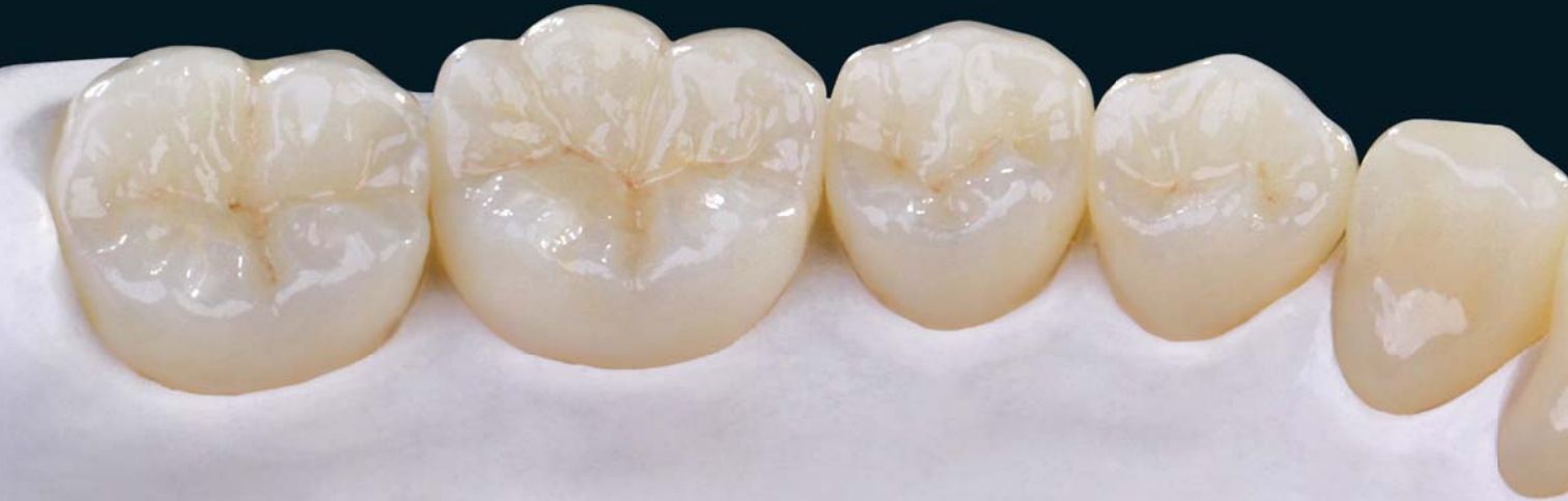
Prettau® Anterior® coloured with ICE Zirkon Malfarben 3D by Enrico Steger Stains