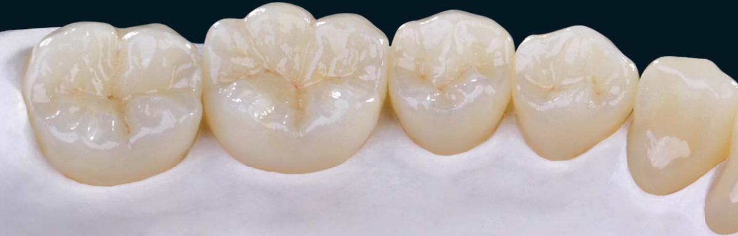
Prettau® Anterior® colored with ICE Zirkon Malfarben 3D by Enrico Steger Stains