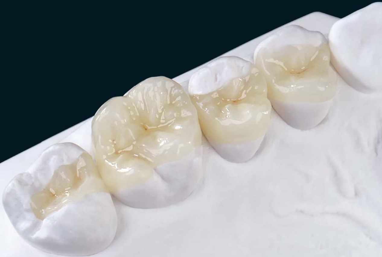
Prettau® Anterior® inlays and onlays, colored with ICE Zirkon Malfarben 3D by Enrico Steger Stains